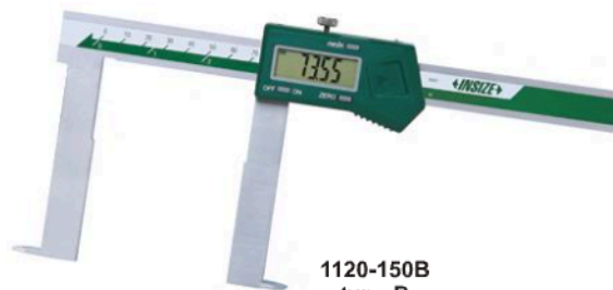
1120-150B type B