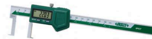
1120-150P type C

Non waterproof, preset (no need to add the width of the jaws on the reading), with data interface