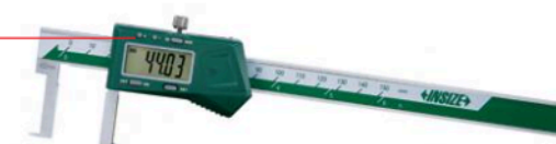
1120-150A type A